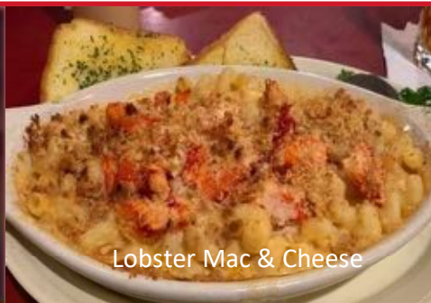
Lobster Mac & Cheese